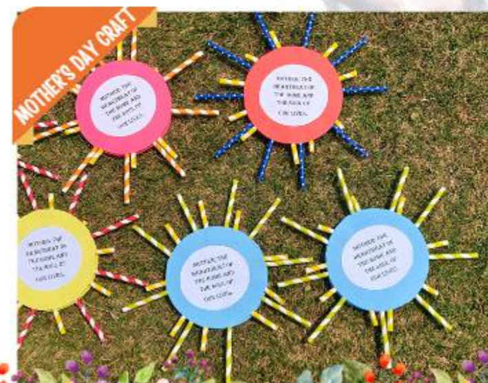
MOTHER'S DAY CRAFT